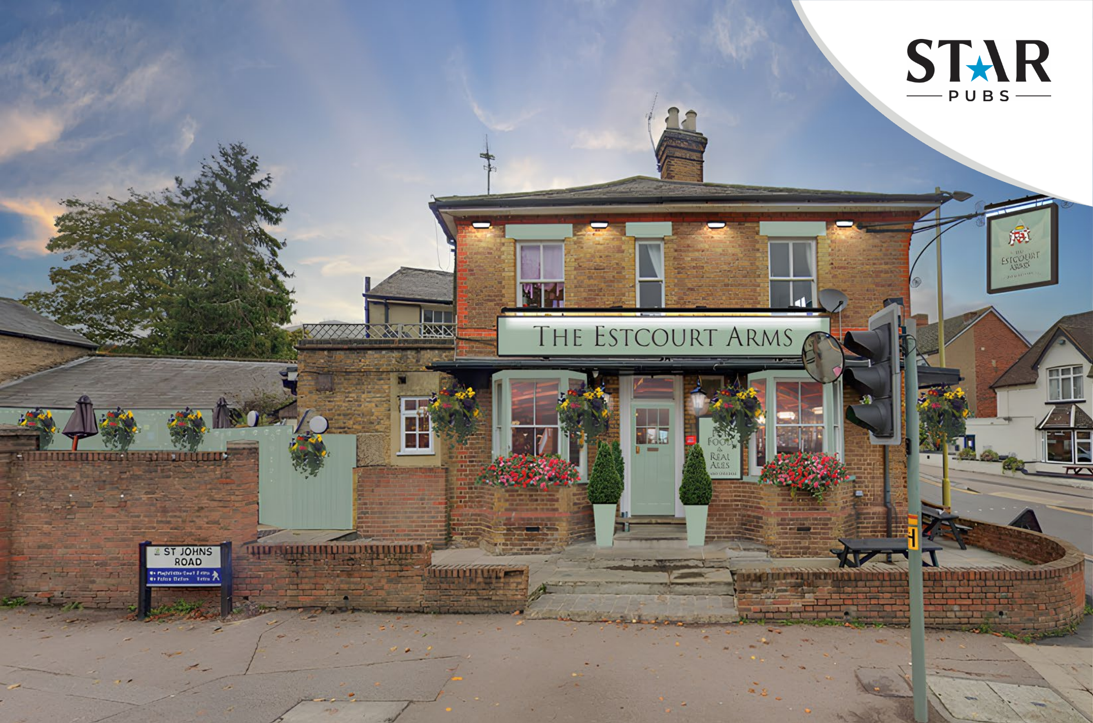
The Estcourt Arms, St Johns Road, Watford, WD17 1PT