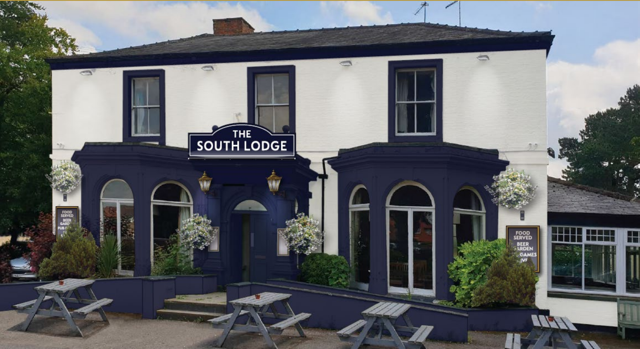
The South Lodge, Harrogate Road, Ripon, HG4 1ST