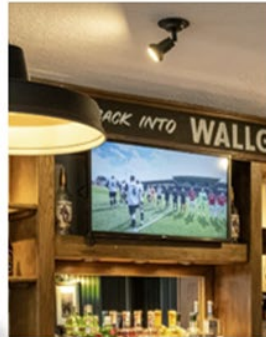
TV Locations in Backfitting.