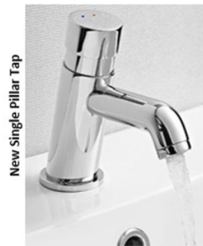
New Single Pillar Tap