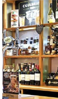
Add new shelving to exiting backfitting. Paint / Tile rear panels.