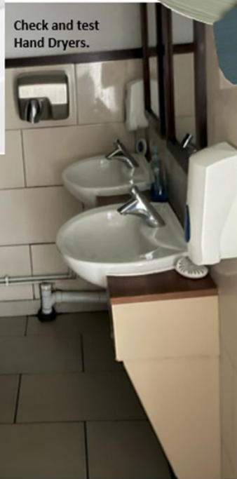
Check and test Hand Dryers.