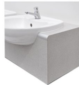
New Vanity base style.