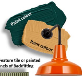
Ceramic Feature tile or painted t&g to panels of Backfitting