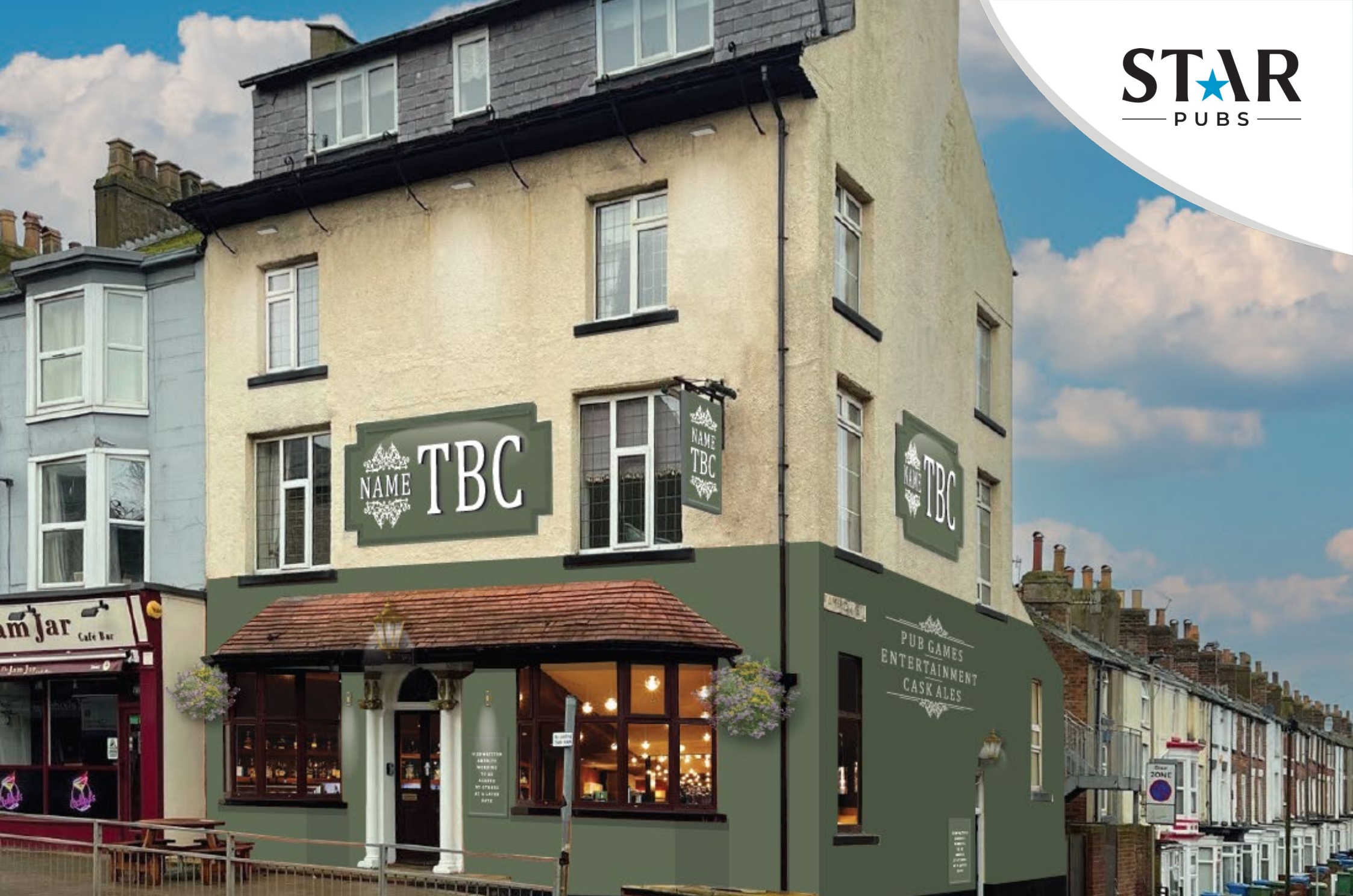
The Spa, 45 Victoria Road, Scarborough, YO11 1SH