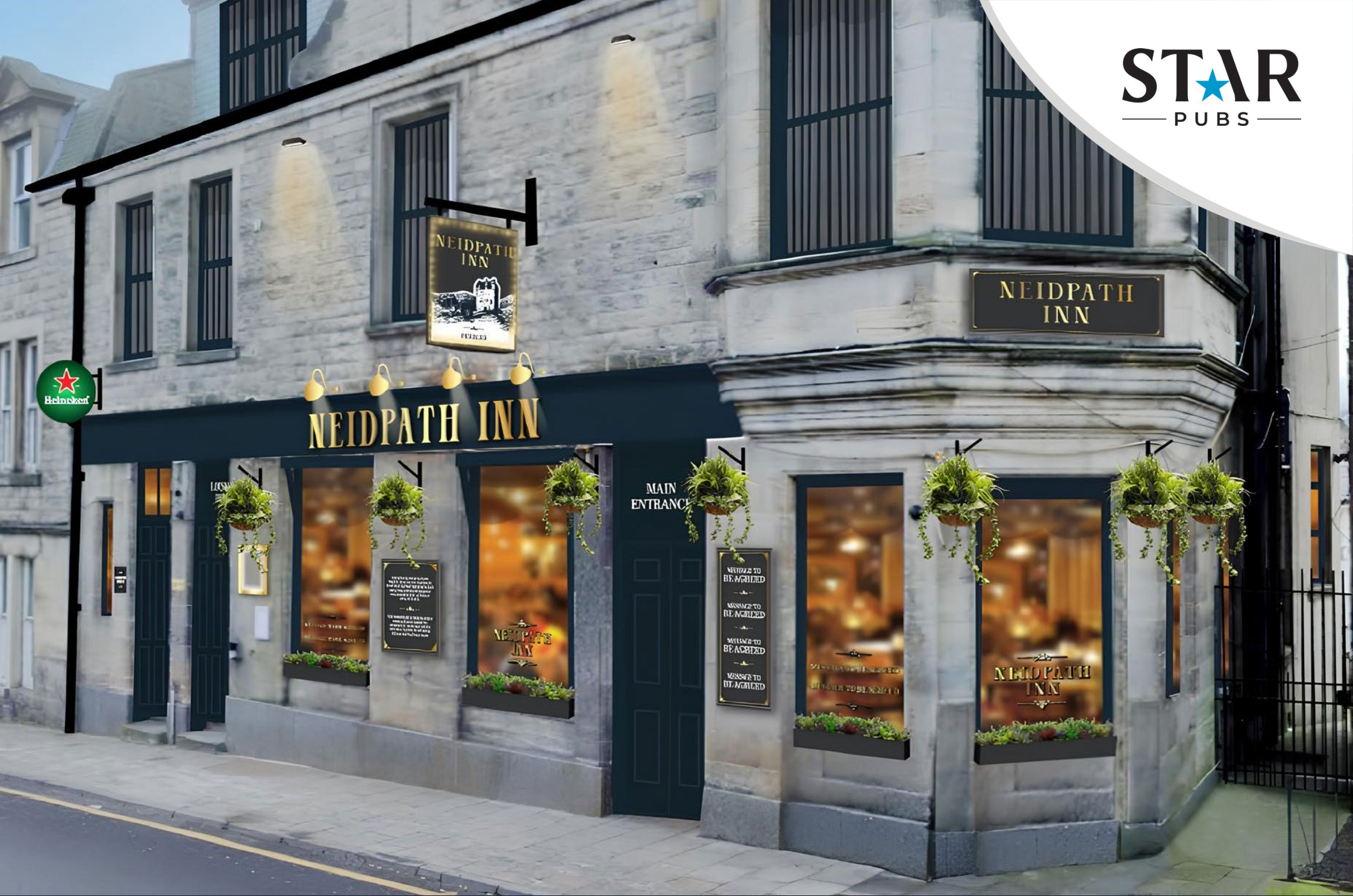
● Neidpath Inn, 27-29 Old Town, Peebles, EH45 8JF ●