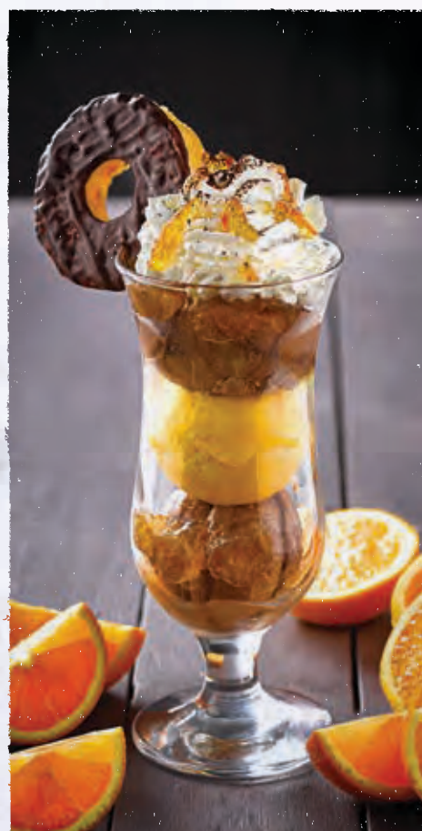
Alcohol (*) Bones (+) Vegi (V) Vegan (VE)

Ask at the bar for our range of Fruit Shoot & Fruit Shoot Hydro Flavours. (Not included in the meal deal.)