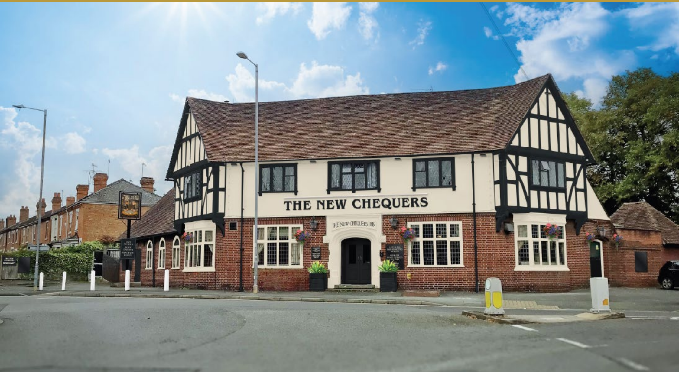
The New Chequers, Astwood Road, Worcester, WR3 8HD