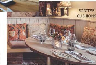
PAINT TIMBER FIXED SEATING