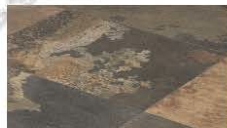
INDUSTRIAL CLEAN FLOOR TILES