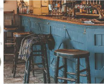
PAINTED BAR OPTION