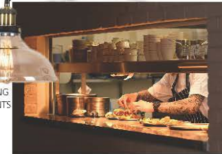
NEW OPEN KITCHEN PASS