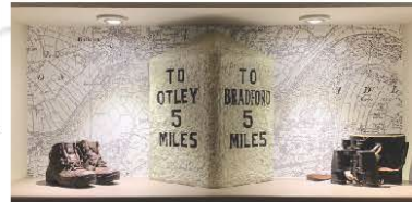
STONE ROAD MILE MARKER