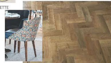
HERRINGBONE LVT FLOORING