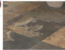
INDUSTRIAL CLEAN FLOOR TILES