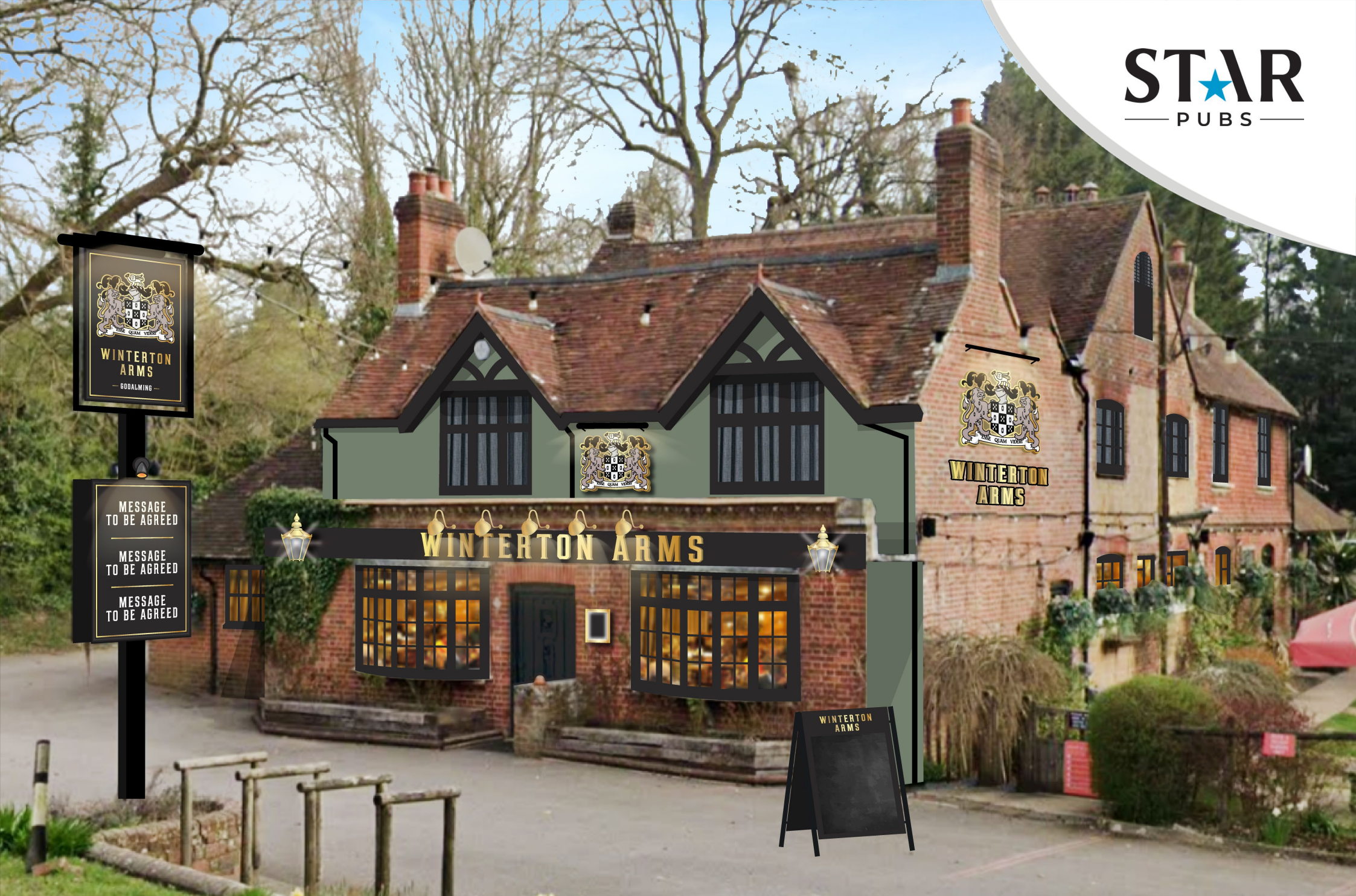
● The Winterton Arms, Petworth Road, Godalming, GU8 4UU ●