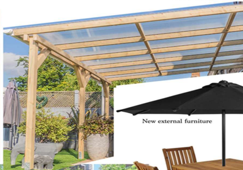
New external furniture