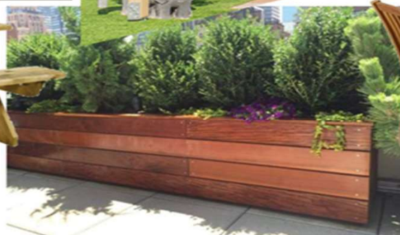
New timber planters

External Scheme The Manor House - Wortham