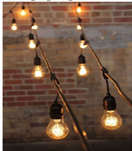
Festoon lighting throughout