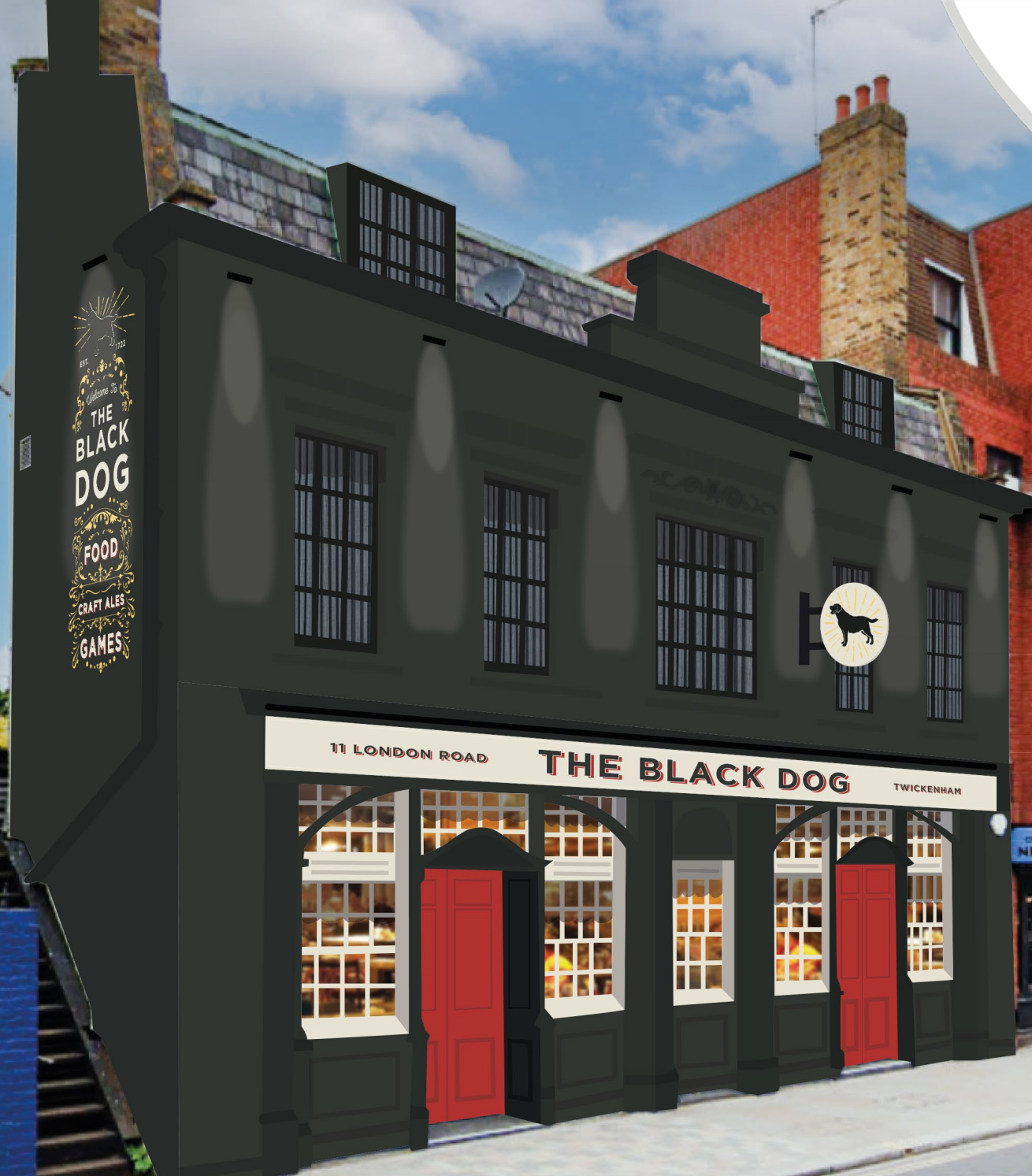
● The Black Dog, 11 London Road, Twickenham, TW1 3SX ●