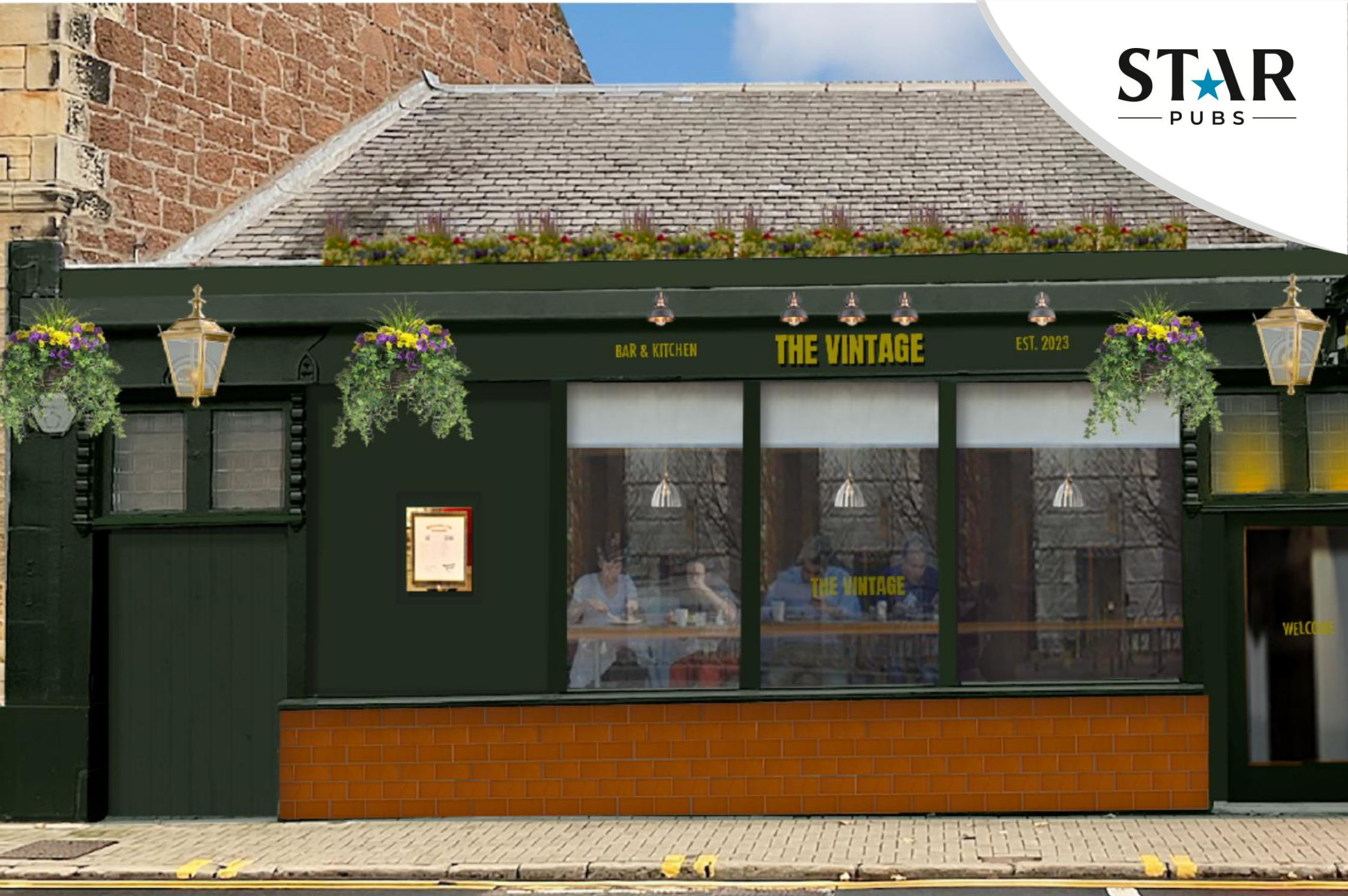
The Tavern, 3/5 The Cross, Prestwick, KA9 1AJ