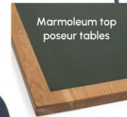
Marmoleum top poseur tables