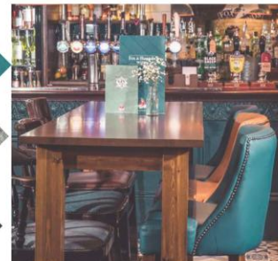
New poseur seating & stools