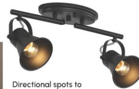
Directional spots to existing positions