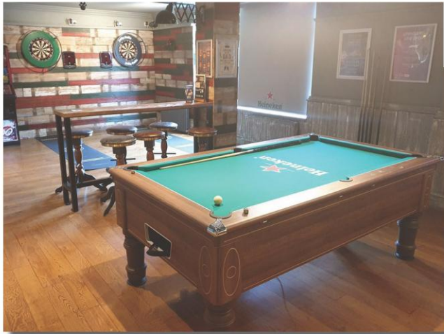
Recessed darts board