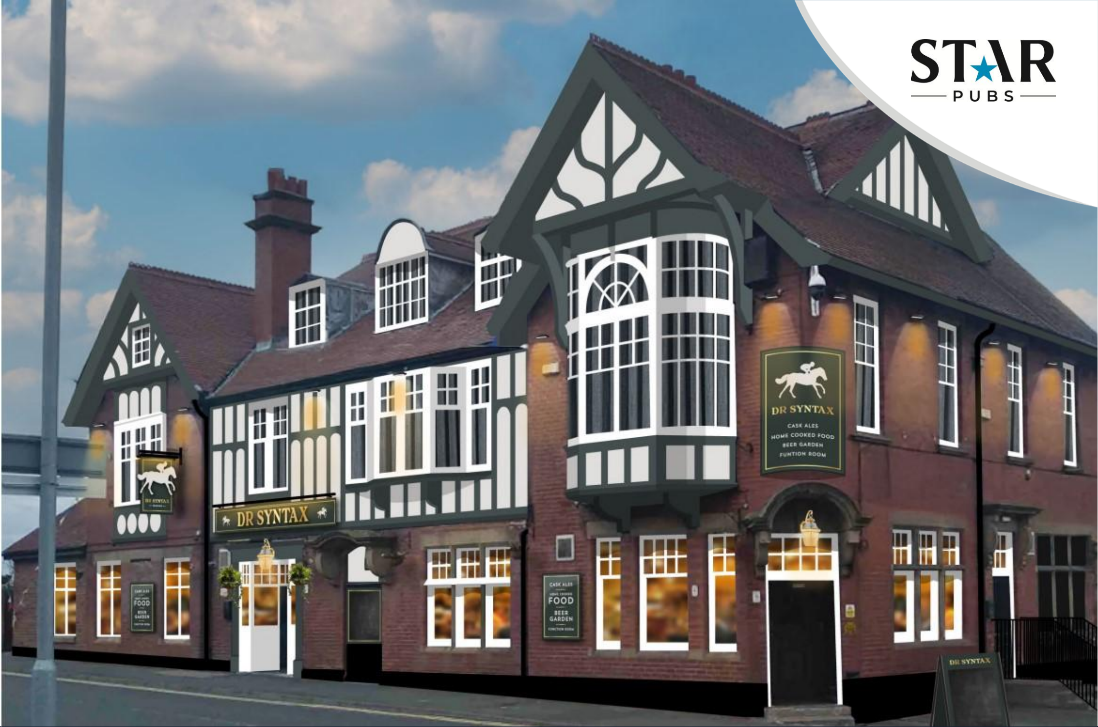
● Dr Syntax, 1 West Road, Prudhoe, NE42 6HP ●