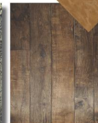
Re-stain timber floor