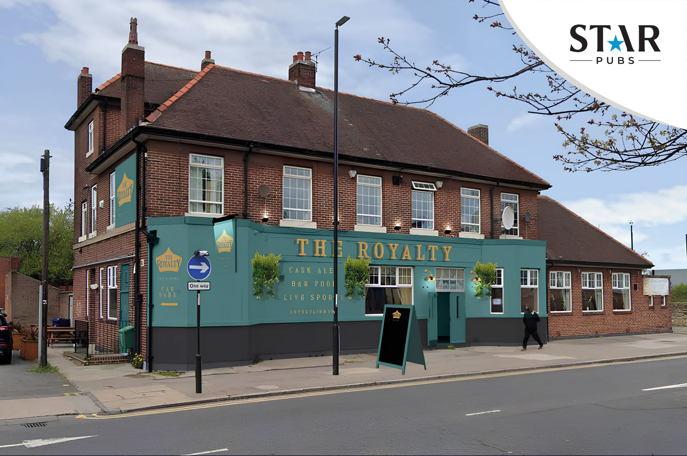
The Royalty, Chester Road, Sunderland, SR2 7PP