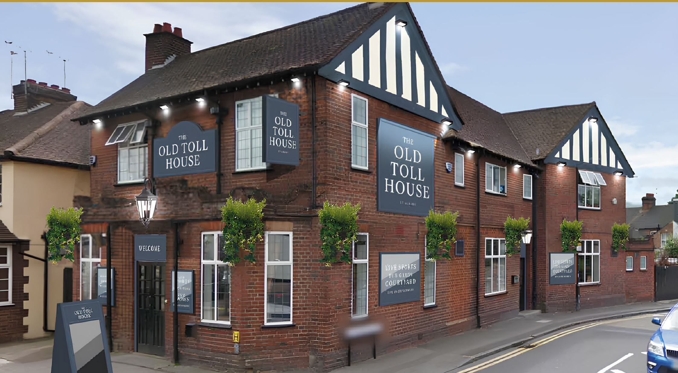
The Old Toll House, Hatfield Road, St. Albans, AL1 4UN