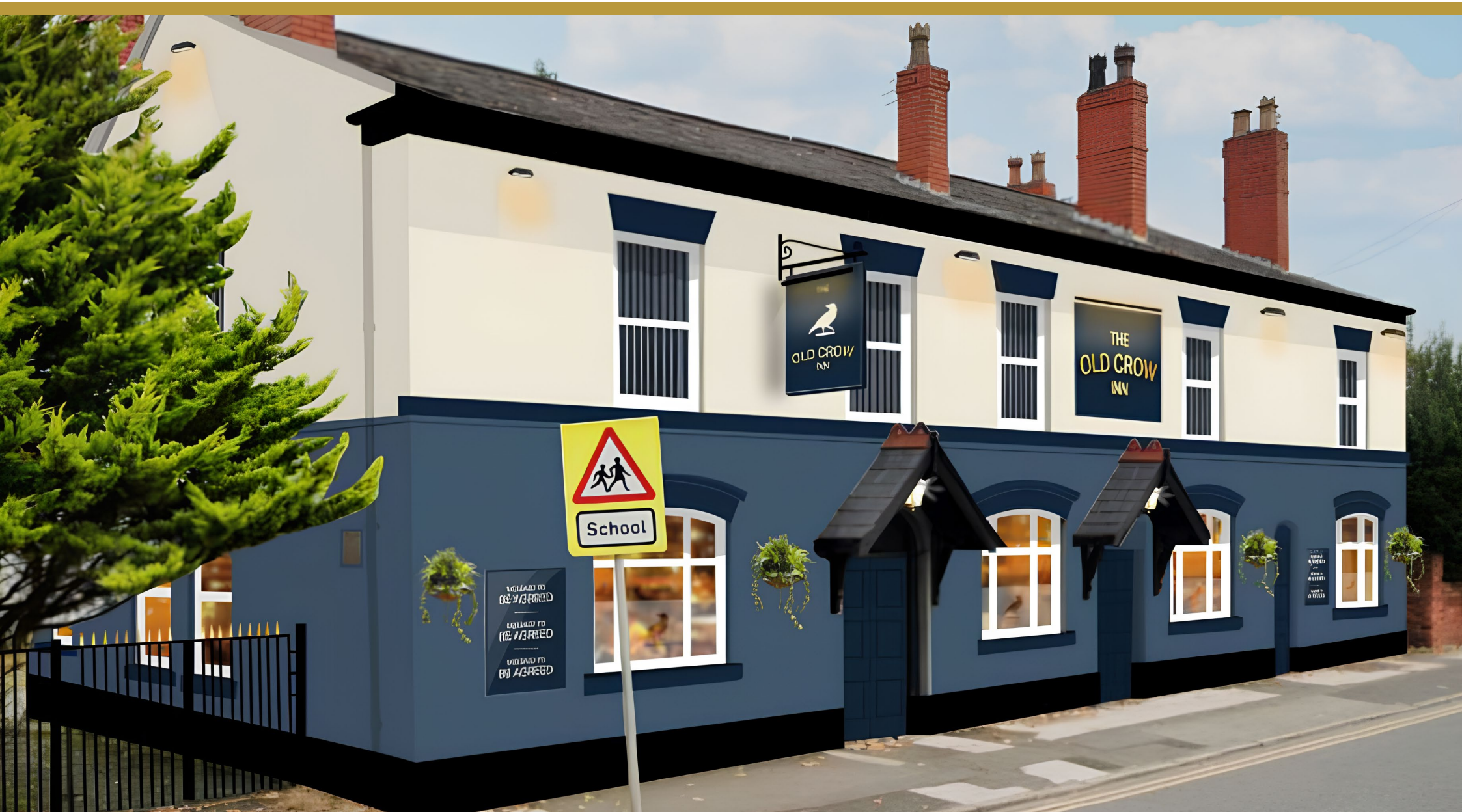
The Old Crow, 248 Crow Lane East, Newton Le Willows, WA12 9TZ