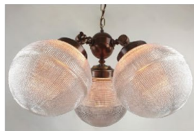
NEW DECORATIVE LIGHTING