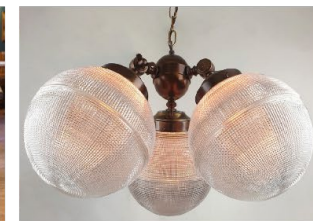
NEW DECORATIVE LIGHTING