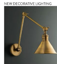
NEW DECORATIVE LIGHTING