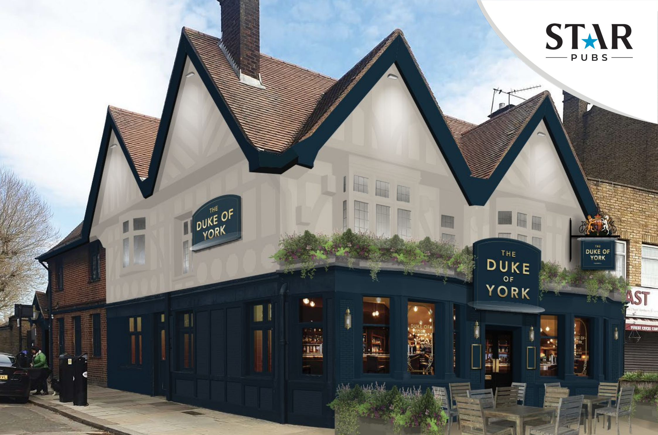
● The Duke of York, 161 Uxbridge Rd, Hanwell, London, W7 3SP ●