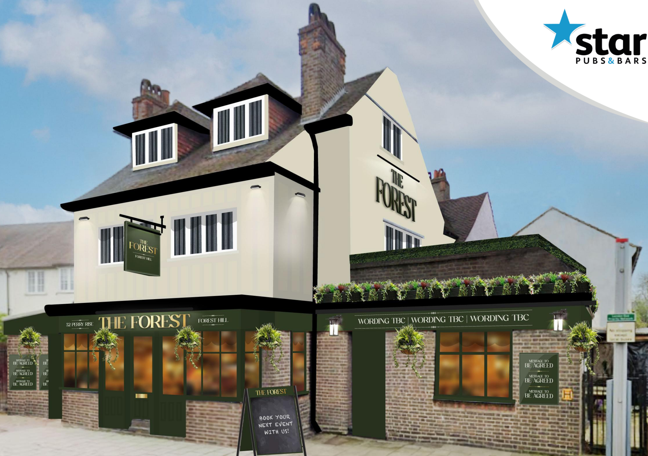
The Forest, 52 Perry Rise, London, SE23 2QL