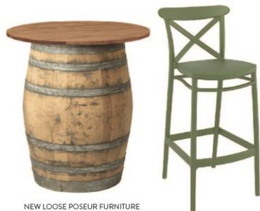
NEW LOOSE POSEUR FURNITURE