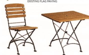
NEW LOOSE FURNITURE