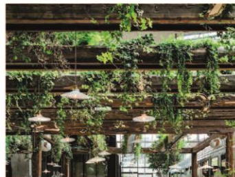
PLANTING TO PERGOLA