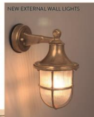
NEW EXTERNAL WALL LIGHTS