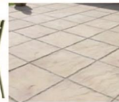
EXISTING FLAG PAVING