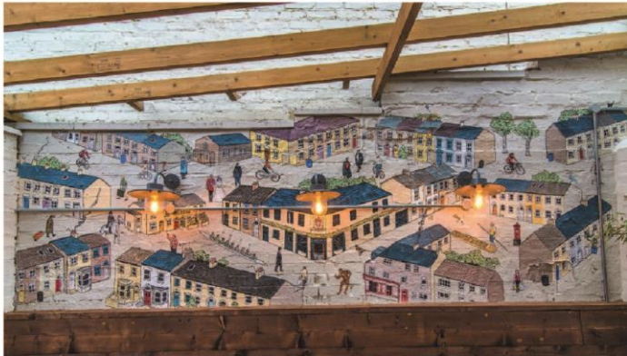
NEW MURAL TO BACK WALL OF EXISTING PEGOLA