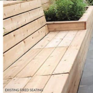
EXISTING FIXED SEATING