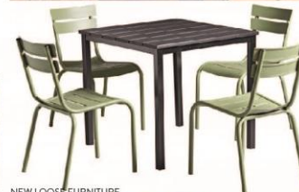
NEW LOOSE FURNITURE